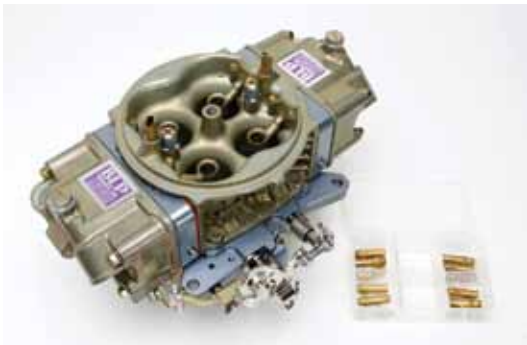
CUSTOM HOLLEY RACING CARBURETOR