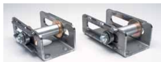
SLIDER SPRING MOUNTS