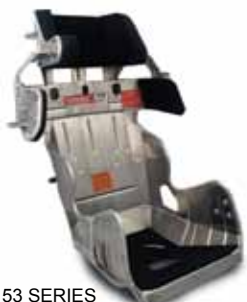
53 SERIES WITH HEAD AND SHOULDER UNITS