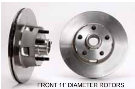
FRONT 11' DIAMETER ROTORS

Cryo-Rotor+Hub Each (Cryogenic treat rotor-hub assembly)