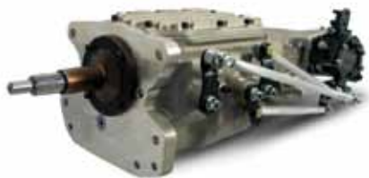
SHOWN WITH OPTIONAL PRO-BILLET SHIFTER