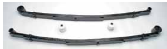
FULL COMPETITION SPRINGS