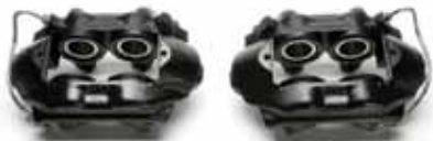
FOUR PISTON CALIPERS 11"

This period correct 11" disc brake kit features cast iron 4 piston calipers nearly identical to the originals used on 1965 Mustangs except they are fitted with lighter weight pistons made of stainless steel and have 1967 style 7/16" inlet ports. Rotors are one piece cast iron, straight vane ventilated, .8125" thick x 11.25" diameter, suitable for most vintage race applications requiring OE type brakes. This non-power application kit includes everything pictured above with a 1" dual master cylinder, adjustable proportioning valve, OE type pads and rubber flex lines. We also offer a non-vintage style kit featuring aluminum four piston calipers, slotted rotors, high performance pads and stainless braided lines as well as the 1" dual master and adjustable proportioning valve, etc. Both kits fit manual brake applications only. Cryogenic treatment of the rotors is an available upgrade for extra life.