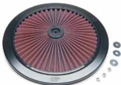
"X-STREAM" AIR CLEANER TOP

AF7 Air filter element, oval, 2-1/4" tall, washable and reusable