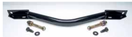
336-101 1965-66 MUSTANG