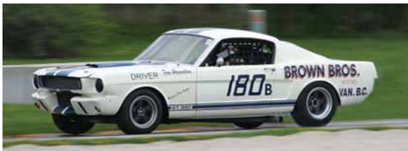
This is 5R333 which was campaigned as an "All Out" vintage racer before we returned it to the period correct "Brown Brothers" livery depicted here.