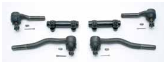
HEAVY DUTY TIE ROD END KIT 100-1005