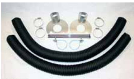
FRONT BRAKE COOLING KIT 11"

Cooling hose, each, orange, 3" diameter by 11 foot length, rated to 500* F