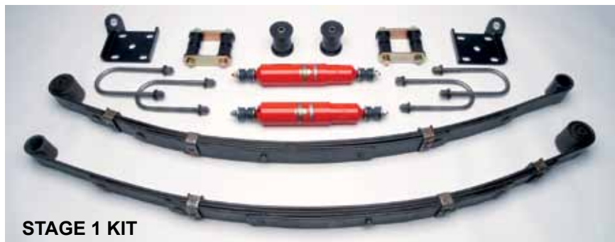
STAGE 1 KIT

Kits are shown with Koni shocks as a first choice. Optional shocks include QA1 Stocker Star gas shocks and Penske gas shocks. Both being gas filled aluminum bodied shocks and are an improvement over the tried and true Koni's. Penske shocks being the top on the option chart are fairly easy to install. Some of the kits highlights are heavy-duty spring perch plates that are designed to work on all axle tube sizes and have a thicker shock mounting area for more shock support. 1/2" U-bolts that can be torqued higher for more clamping force and additional length allows for insertion of lowering blocks at a