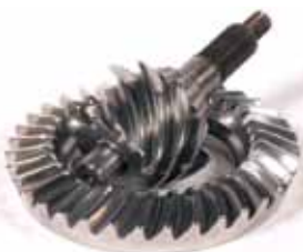
REM TREATMENT SHOWN