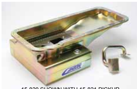
15-820 SHOWN WITH 15-821 PICKUP