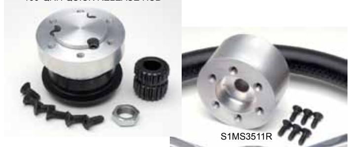
100-QRH QUICK RELEASE HUB