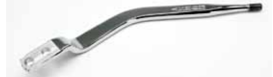
HURST COMPETITION SHIFTER HANDLE #H5386836