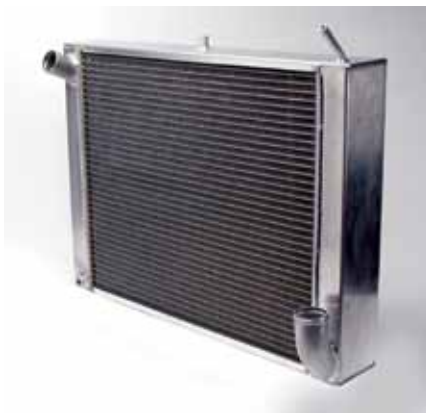
289 COBRA RADIATOR #260-010