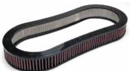
2-1/4" TALL OVAL AIR CLEANER ELEMENT