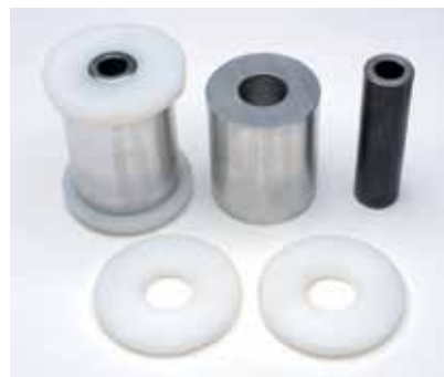
ALUMINUM COMPETITION FRONT EYE BUSHINGS