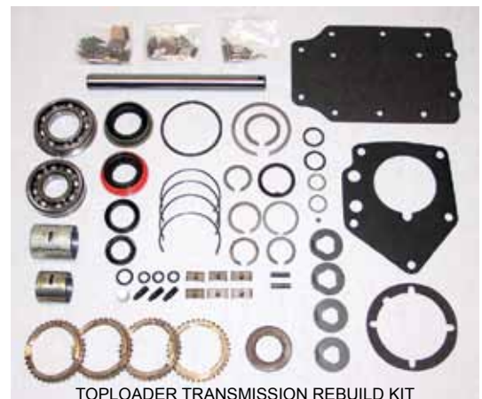
TOPLOADER TRANSMISSION REBUILD KIT