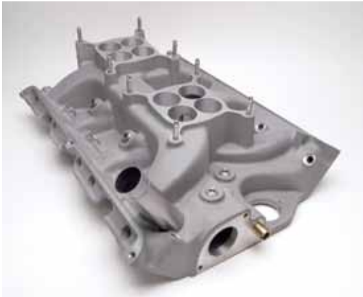
390/427/428 FE 2X4 MANIFOLD