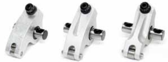
JESEL SPORTSMAN SERIES