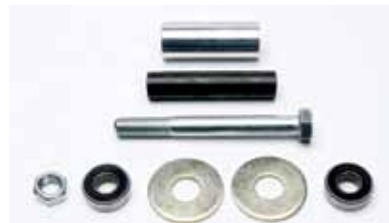
SLIDER MOUNT REPAIR KIT