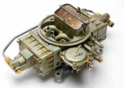
HOLLEY 715 CFM REPRODUCTION