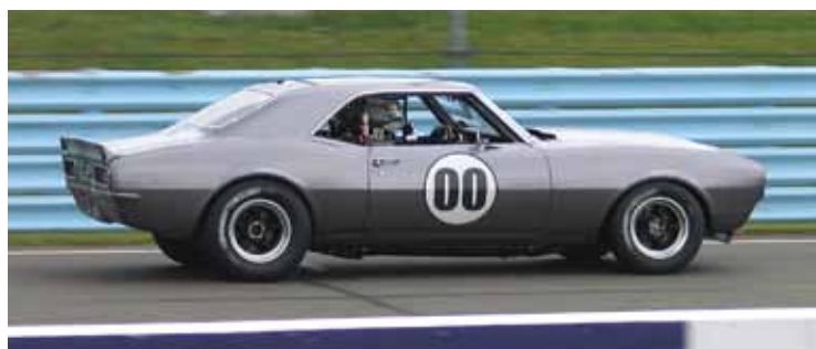
1967 Camaro Trans-Am race car # 00 completely re-engineered and restored by Cobra Automotive.