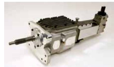
JER-HTINTSHL-O SHIFTER PICTURED INSTALLED

JER-HTINTSHL-O Additional for Jerico Direct Connect internal shifter option