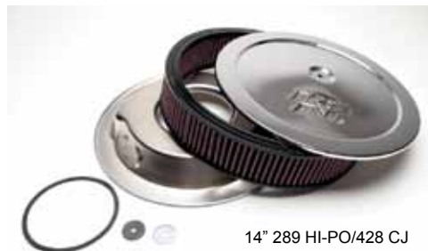
14" 289 HI-PO/428 CJ

303-L289 Reproduction 2x4 bbl linkage kit 289/302 OE style (not pictured)