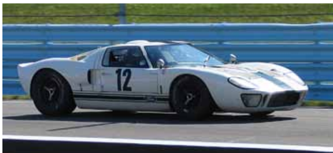
Ford GT40 P/1037 prepared and crewed by Cobra Automotive for Europe during 2008 at Le Mans, Nürburgring and Spa.