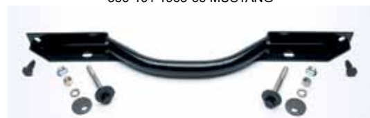
336-1010 1967-70 MUSTANG AND COUGAR