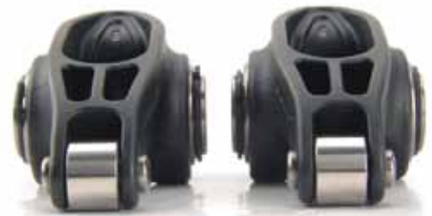
COMP CAMS ULTRA PRO MAGNUM