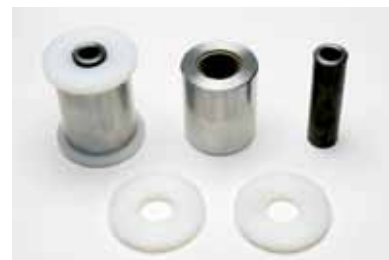
ROLLERIZED ALUMINUM COMPETITION FRONT EYE BUSHINGS