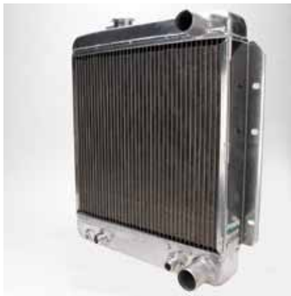
CUSTOM GRIFFIN MUSTANG RADIATOR WITH BOTH OUTLETS ON SAME SIDE #260-003