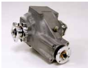
DANA 44 COBRA CENTER SECTION