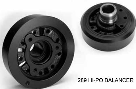
289 HI-PO BALANCER