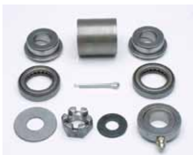
ROLLERIZED STEERING KIT 299-333