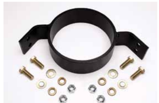
DRIVESHAFT SAFETY LOOP