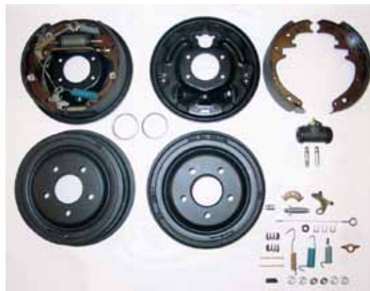
100-209R 10" X 2-1/2 RACE DRUM BRAKE KIT

100-209R 10"x 2-1/2" Race drum brake kit