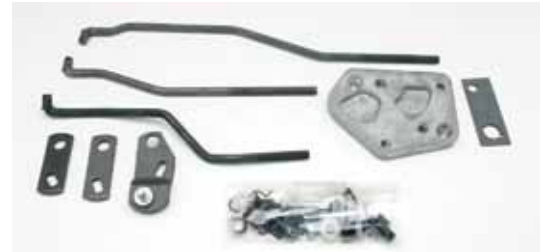
HURST COMPETITION SHIFTER INSTALLATION KIT