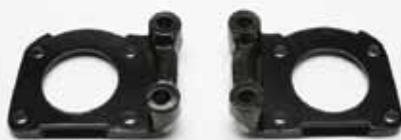
CALIPER MOUNTING BRACKETS 11"

Bolts pair, caliper mounting 1965-67 (Req. 1 pair / caliper)