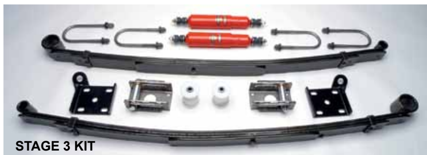
STAGE 3 KIT