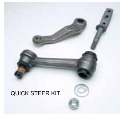
QUICK STEER KIT