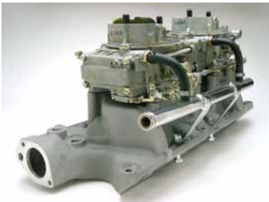
READY-TO-RUN 289-302 2X4V SYSTEM