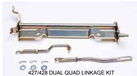
427/428 DUAL QUAD LINKAGE KIT

303-FL427M Reproduction 2x4 bbl linkage kit, 390/427/428