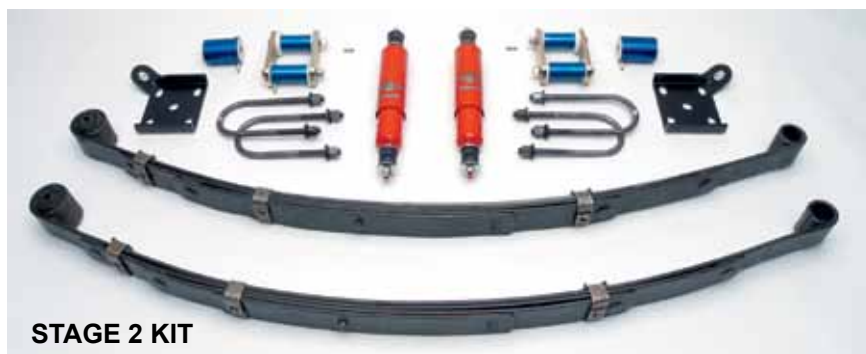
STAGE 2 KIT