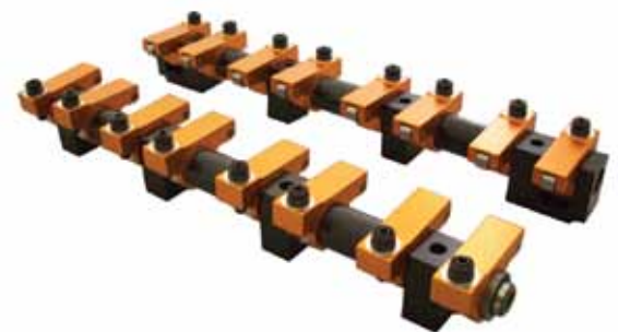
END SUPPORTS SHOWN ON ASSEMBLY TO REAR