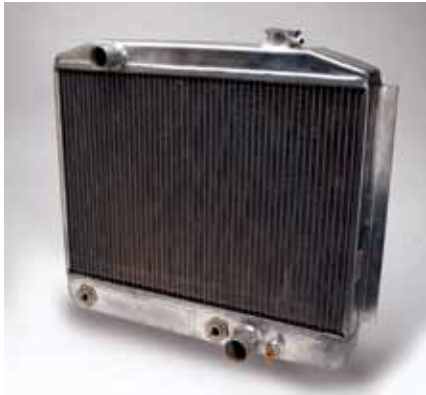
COMPETITION MUSTANG RADIATOR #260-001R

Griffin supplies radiators to many of the NASCAR teams. These special competition radiators are built by Griffin exclusively for Cobra Automotive. With 580 hp on tap, our vintage road race cars require the most efficient radiator we can fit into an early Mustang or Shelby. These radiators are made by Griffin to our exact specifications for a bolt-in fit, while retaining a stock-type appearance. These special aluminum radiators utilize factory radiator hoses, original R-model type mounting points and radiator cap location for ease of installation and maintenance. They can be ordered with a built-in Delphi heat exchanger, which uses lower water temperature to scrub off excessive oil temperature. We have seen as much as a 20-30 degree drop in oil temperature when using a heat exchanger type oil cooler. Our ultimate competition version, pictured here, also uses a reversed inlet hose position to ensure that coolant flows across the entire width of the oversize core. These units require the radiator support opening to be enlarged to fit the 23" wide by 16" tall double row core of 1-1/4" tubes.